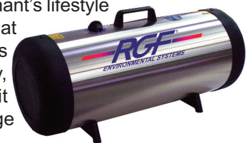
Rapid Recovery Unit

Small generators, costing anywhere from $500 to $3,500 can clear a room of existing odors in a matter of hours. Apartment leasing agents have no doubt experienced the loss of potential tenants due to the presence of offensive odors resulting from a past tenant's lifestyle or pets. When you consider that all apartment rental agents deal in the same commodity, perhaps an odor-free unit could give one unit an edge over another.